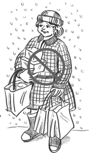
Keep hands free